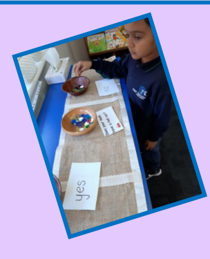
MATHS in M4

Students have been collecting and reading data about their mums. They have been discussing how activities fit into the 5 drawers of Maths. Students have been quantifying and partitioning numbers. They are learning how to approximate a quantity and then count the quantity knowing that the last number tells us "how many". We are improving writing the digits.